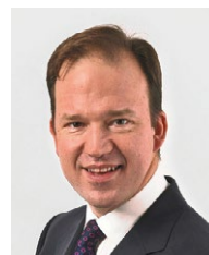
Rt Hon Jesse Norman MP

Minister of State for the Cabinet Office and Her Majesty's Treasury