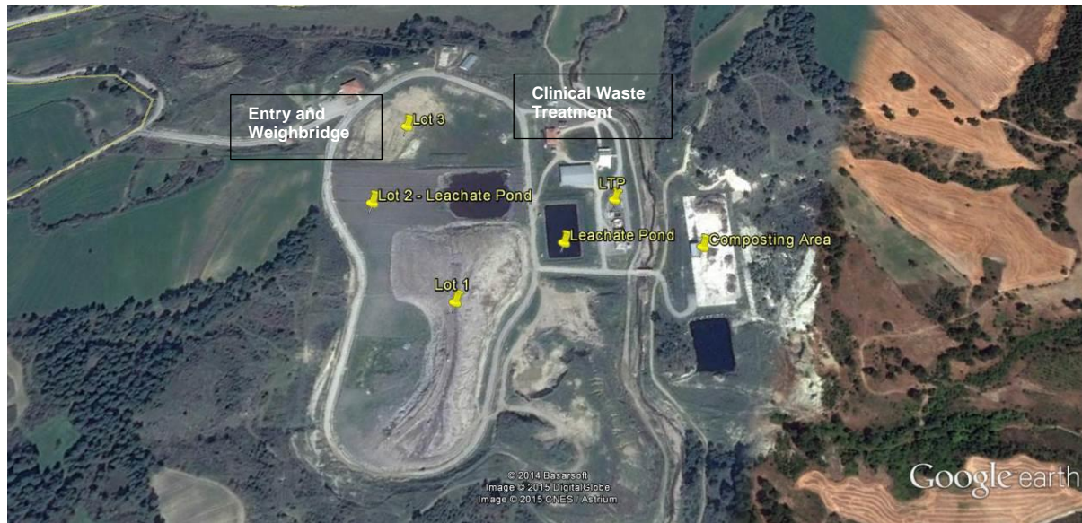
Figure 3: ÇAKAB Landfill Layout

The company Suez Canakkale will take over the operations of landfill and assume full responsibility of the three bring centres and collection and transportation of wastes.