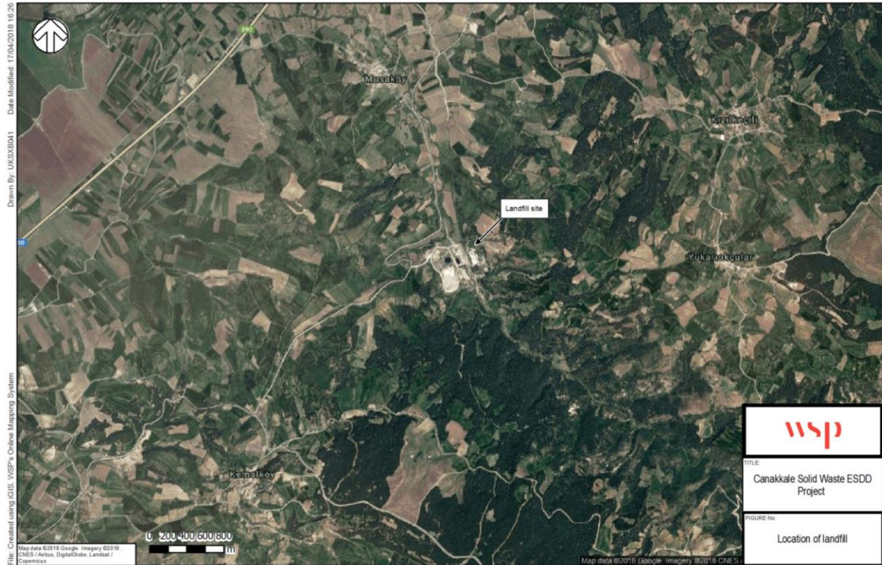
Figure 2: Location of the ÇAKAB Landfill

Note: Kemel (Kemalkoy) and Musaköy villages shown in relation to the landfill site on the map.